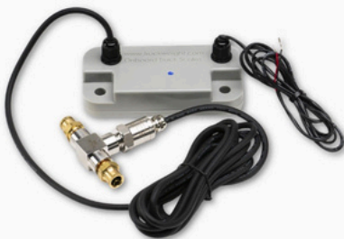
Air Suspension Sensor

Low cost, patented solutions for vehicles with air suspensions that calculates accurate axle and gross vehicle weight readings in all weather conditions based on temperature and pressure change in the suspension.