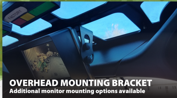
OVERHEAD MOUNTING BRACKET Additional monitor mounting options available