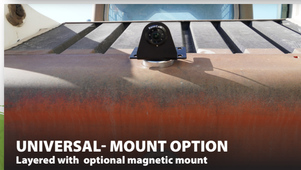
UNIVERSAL- MOUNT OPTION Layered with optional magnetic mount