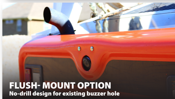
FLUSH- MOUNT OPTION No-drill design for existing buzzer hole