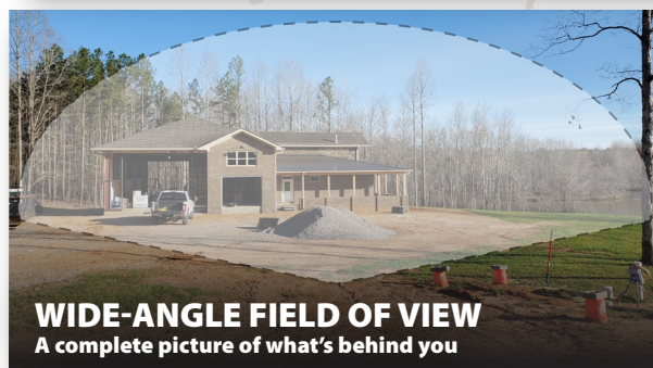
WIDE-ANGLE FIELD OF VIEW A complete picture of what's behind you